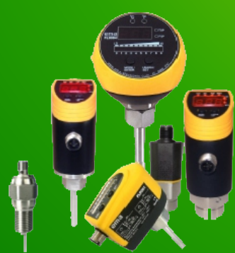
Pressure, Flow, Level Sensors